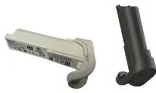
Black: BAT-SCN11WC White: BAT-SCN11WCHC

Smart battery: Lithium-ion battery for Xenon™ Ultra 1962 Bluetooth® scanners.