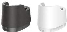
General Purpose (Black) Battery Cup: 1962G-BAT-CUP

Desktop/Wall mount charge and communication base, class 1100M/class 2 10M Bluetooth, black, disinfectant ready housing.