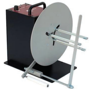
CAT-3-TA-ACH with APG

keep the unit from moving. The CAT-3 handles any rewind job and with its "HIGH" torque range can also power the LABELMATE S-100 or S-200 Label Slitters. Reliable, high quality and maintenance-free.