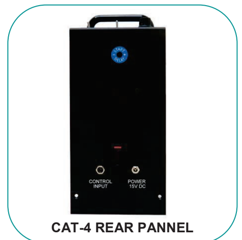
CAT-4 REAR PANEL